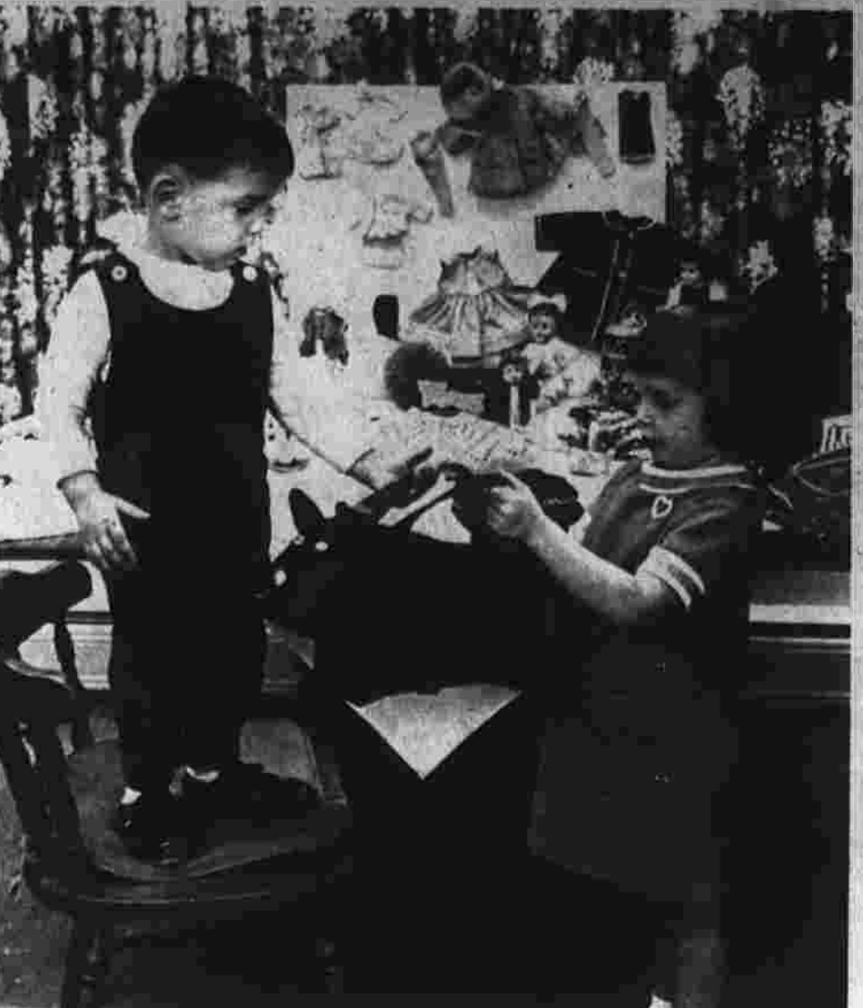
Christmas Fair at Bolton Church Saturday

LONDON — The great meth-ods of transportation in mid-19th century England was the hired carriage. One of the most fa- mous was the Nimrod, which ran from the Victoria Hotel in London's Piccadilly to Oxford's Mile Tavern. The nimrod was un-derlying; in fact, it was in-vented on a brass plate on the carriage.