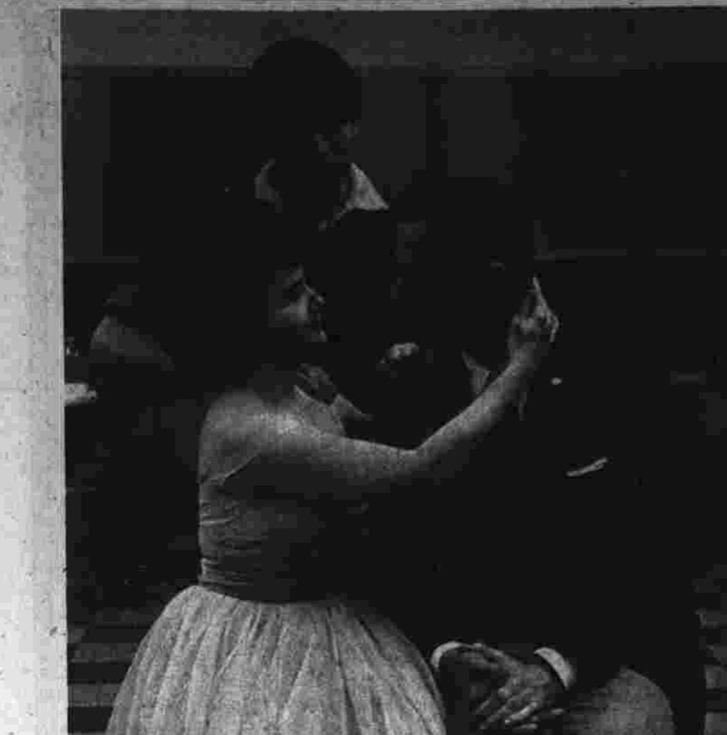
Herald Album Of Schools.

FUEL OIL 14.8c. 990 Gal. Delivery. G.O.D. One Day Notice for Delivery. Around The Clock Burner Service. After Hours Emergency Oil Deliveries Made at 14.4c per Gal. Automatic Oil Delivery. Ask About Our 5-Day Discount Payment Plan. MANCHESTER OIL HEAT INC. 405-406 February St. Regular Fuel Oil