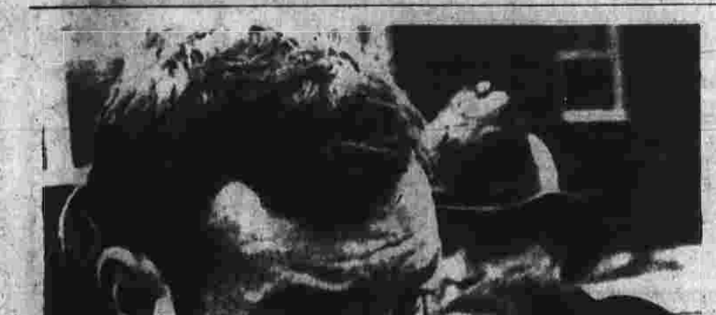
PRAGUE (AP) - Thousands of Ambulances carried away hundreds of wounded anti-Soviet rioters during the six hours of rioting which marked a tense, uneasy observance of the 21st anniversary of the Bolshevik Revolution.